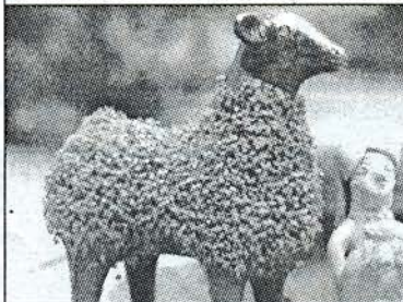
This authentic Mexican chia goat stands one foot tall.