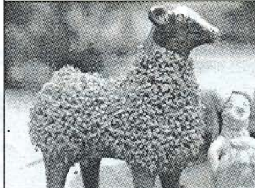
This authentic Mexican chia goat stands one foot tall.